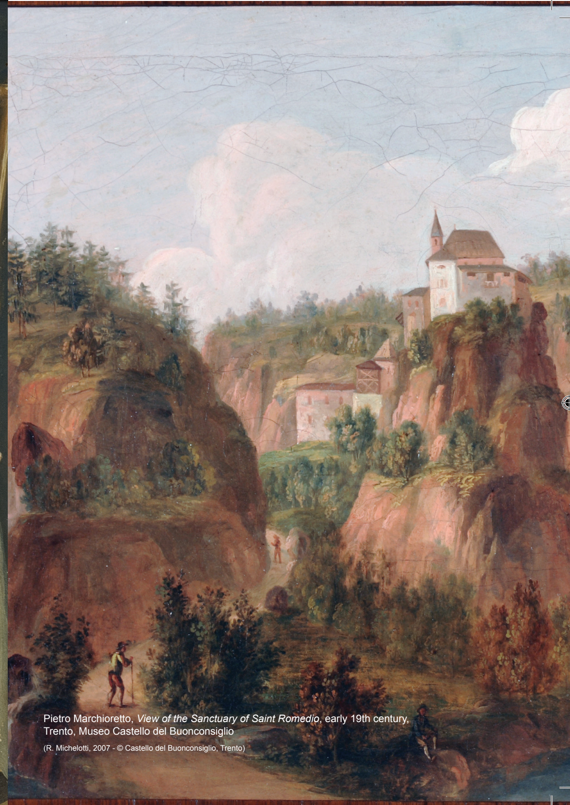
Pietro Marchioretto, View of the Sanctuary of Saint Romedio , early 19th century, Trento, Museo Castello del Buonconsiglio