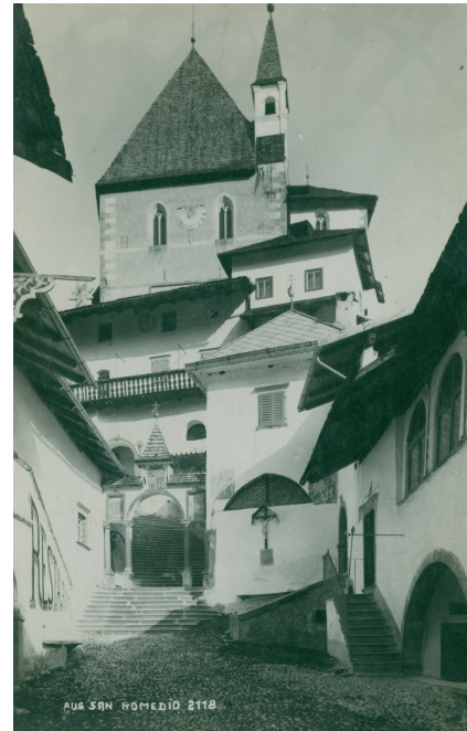
Inside of the Sanctuary of Saint Romedio, 1913

According to medieval biographies of saints, on his return from a pilgrimage to Rome around the end of the 4th century AD, the nobleman Romedius, originally from Thaur in the Inn valley, decided to withdraw to a cave and live as a hermit in the Val di Non area, in an inaccessible valley a short distance from Sanzeno, together with his companions Abraham and David. In actual fact, as historic and archive investigations have shown, the existence of the hermit, a member of an aristocratic Bavarian family, can be dated to the first decades of the 11th century. The first certain news of the cult – which extended from the Prince Bishopric of Trento right up to Austria and Bohemia – dates back to the end of the 11th century, the era in which the sanctuary was founded above a small cave, the place where Romedius lived and was buried.